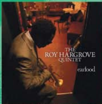
THE ROY HARGROVE QUINTET EARFOOD