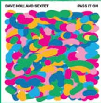
DAVE HOLLAND SEXTET PASS IT ON