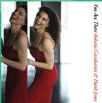
ROBERTA GAMBARINI & HANK JONES YOU ARE THERE